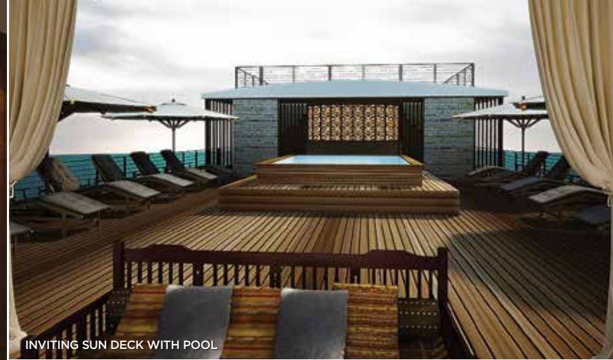
INVITING SUN DECK WITH POOL