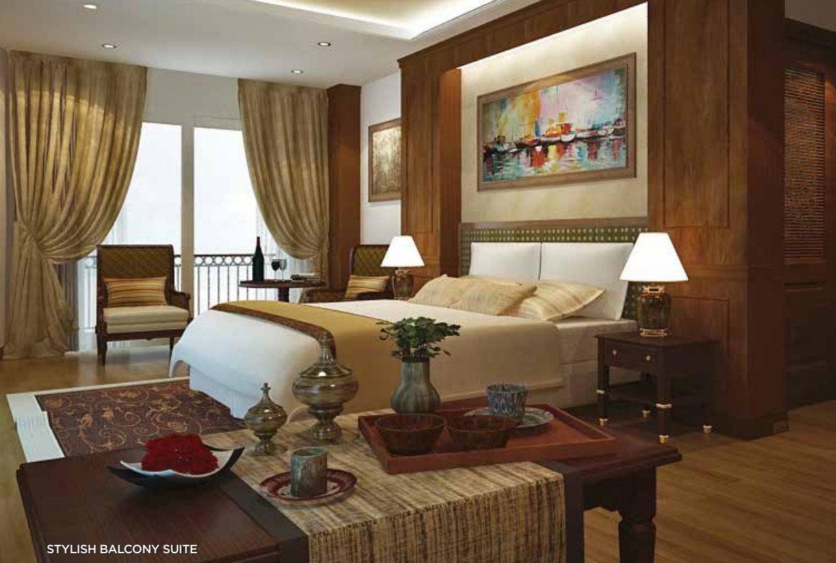
STYLISH BALCONY SUITE