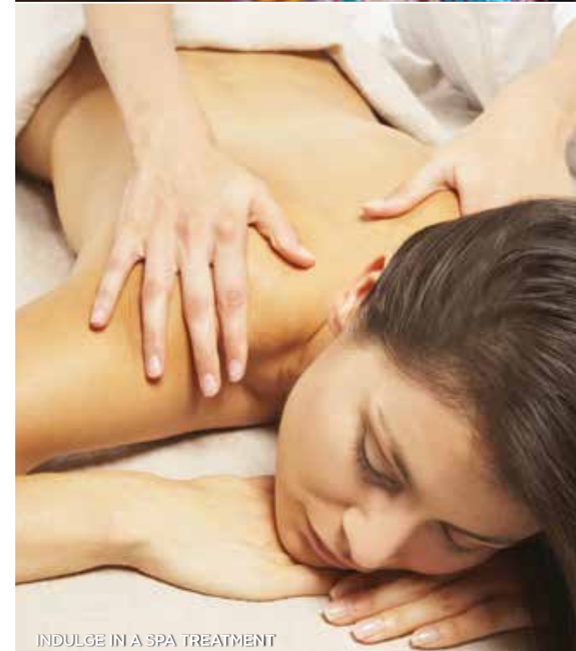
INDULGE IN A SPA TREATMENT