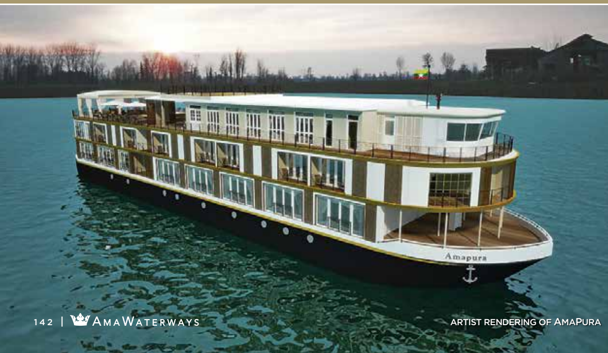
ARTIST RENDERING OF AMAPURA