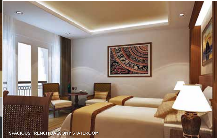
SPACIOUS FRENCH BALCONY STATEROOM