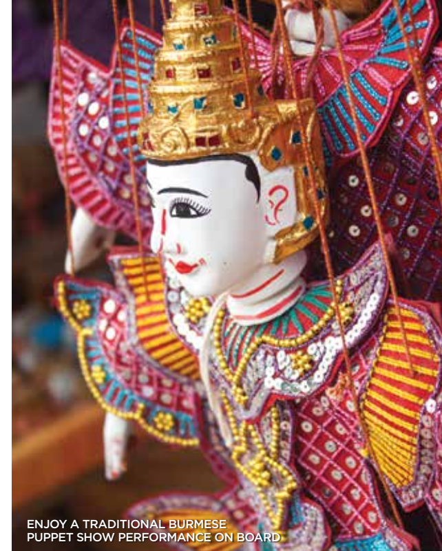
ENJOY A TRADITIONAL BURMESE PUPPET SHOW PERFORMANCE ON BOARD

Note: Ship images of the AMAPURA are artist renderings. Updated photos and specifications will be posted on www.AmaWaterways.com as they become available.