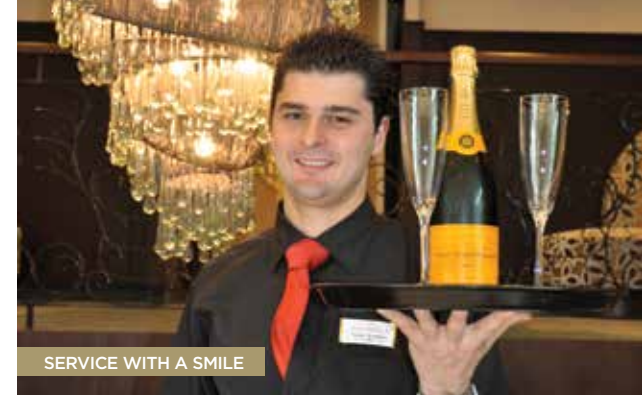
SERVICE WITH A SMILE